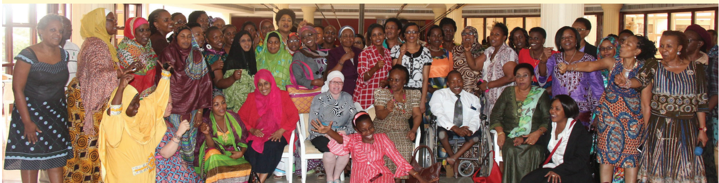
Coming together is a good way of sharing experience about gender issues. Above is a group photo of women activists after one of their meetings