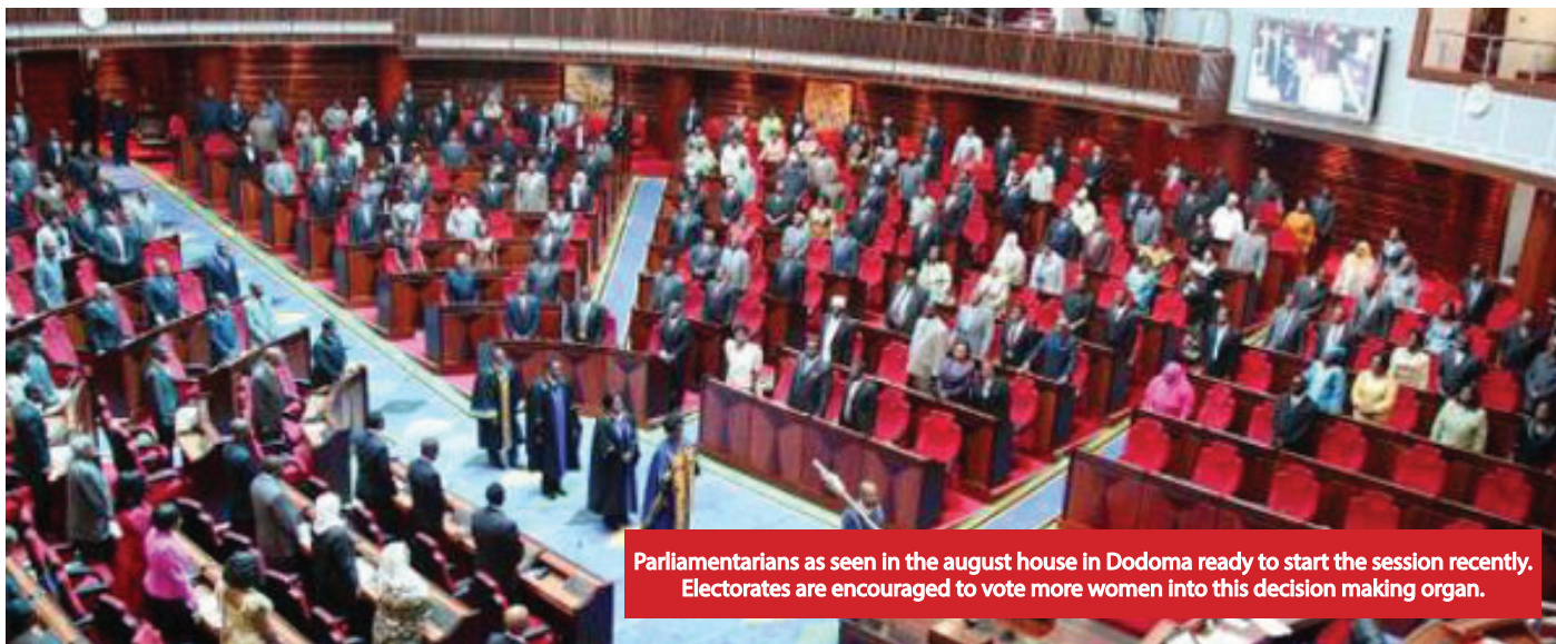
Parliamentarians as seen in the august house in Dodoma ready to start the session recently. Electorates are encouraged to vote more women into this decision making organ.