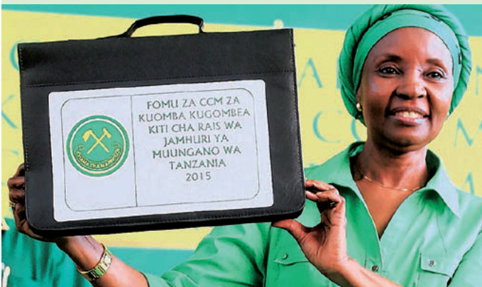
Dr. Asha Rose Migiro, is one of seven women aspirants who expressed interest to contest presidency through the ruling party ticket, Chama Cha Mapinduzi (CCM). Though she did not win it, she ended up in the top three finalists, where Dr. John Magufuli was handed CCM flag for the coming elections.

T anzania reverted to multiparty democracy in 1992 and held the first general elections in 1995, where only one woman expressed interest to take up the top civil servant post; the presidency.