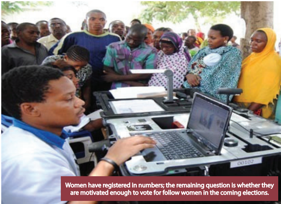
Women have registered in numbers; the remaining question is whether they are motivated enough to vote for follow women in the coming elections.