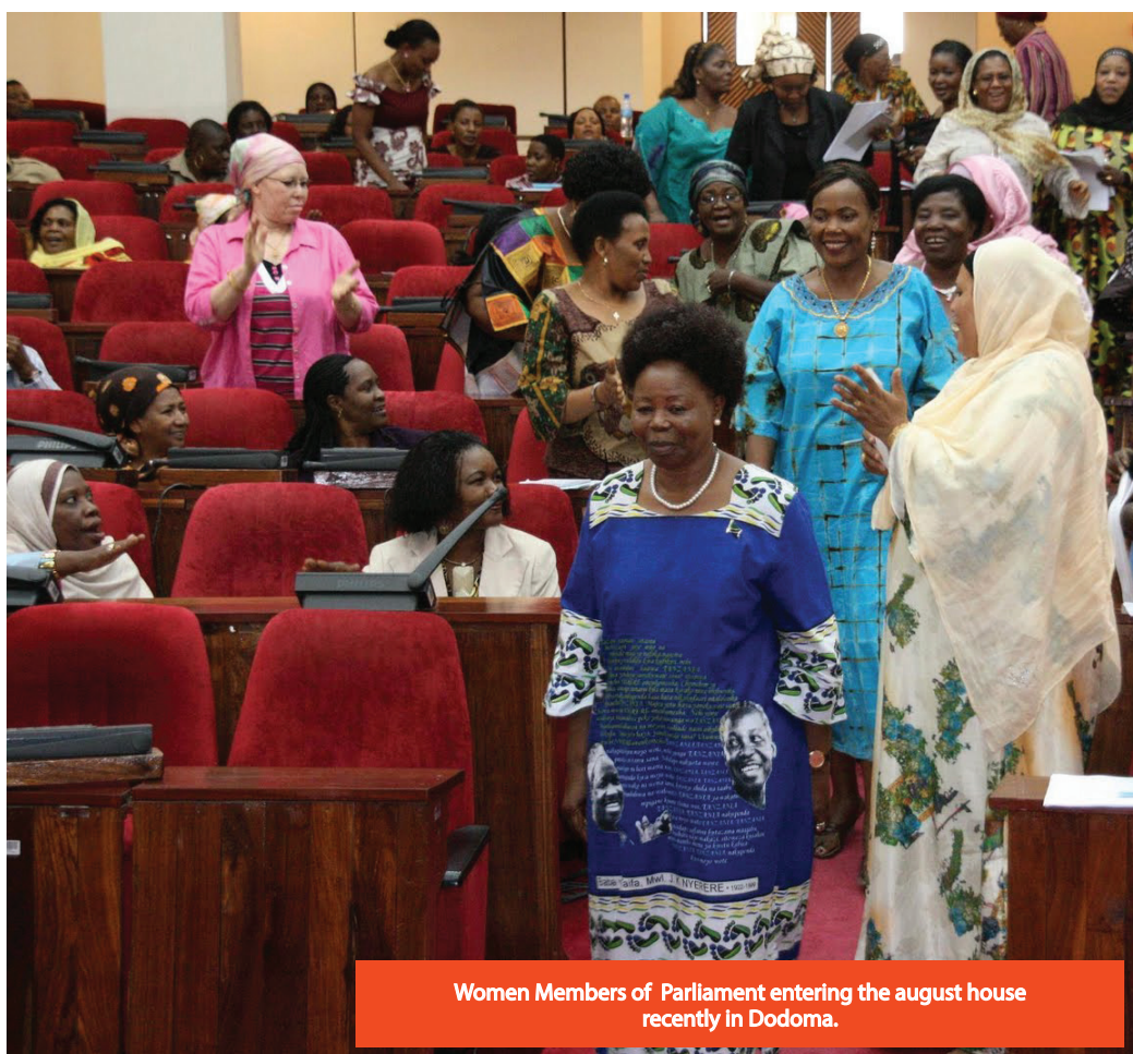
Women Members of Parliament entering the august house recently in Dodoma.