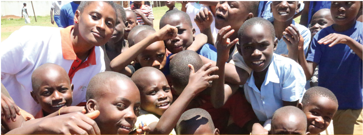
Children's agendas need to be given priority by candidates