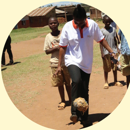
Guess who is going to emerge the winner